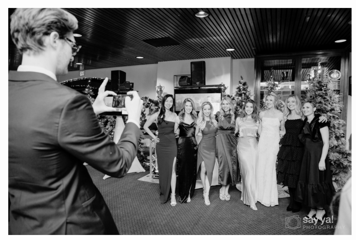
Holiday Ball 2022